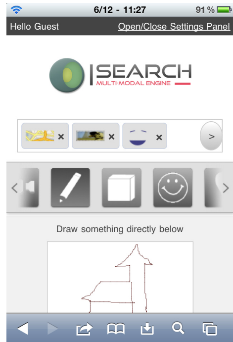
(a) Multimodal query consisting of geolocation, video, emotion, and sketch (in progress).